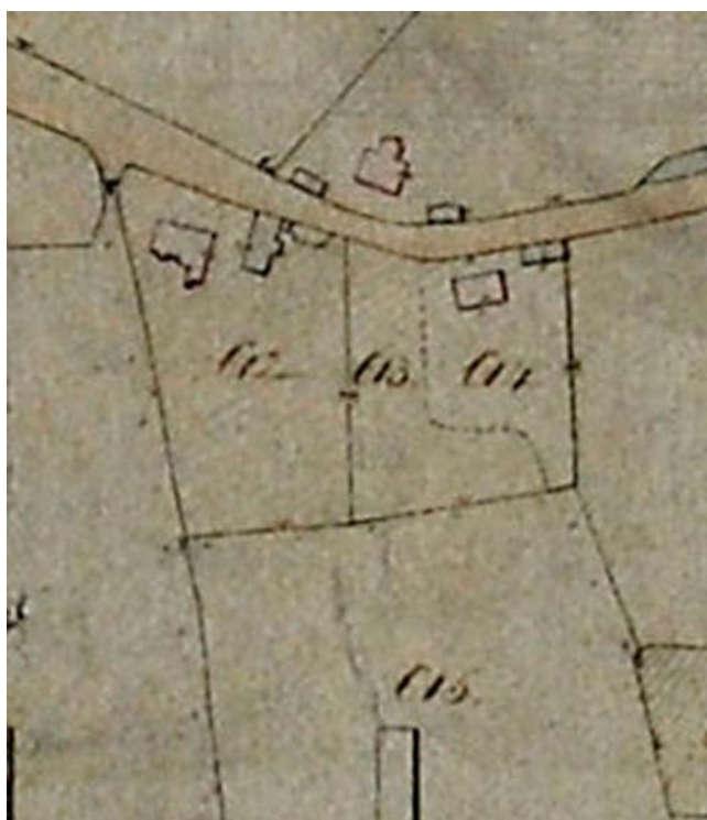
Plan Nos.612, 613, 614 and 615 of the Ryde survey