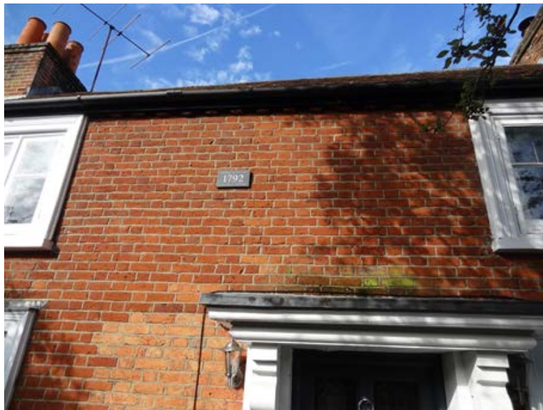
The brickwork around the front door