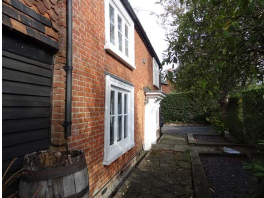
Along the front of the cottage showing the tile faced extension to the south on

The brickwork shows that the present doorway has been added at a later date and the apparent bessumer inside to the north chimney is deceptive in that whilst it appears adequate to support the wall above, inspection reveals it is only a few inches deep. As might be expected there is no evidence of a supporting timber structure but there is no doubt to the cottage having been built in 1794. The bricks bearing this date can be believed for a change.